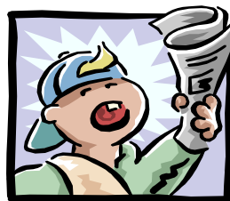
50% by December 13th

Acquisitions sets ordering deadlines in order to make sure we are able to spend the library's funds. Over Christmas, our staff has vacation time, so ordering will slow until the beginning of the new