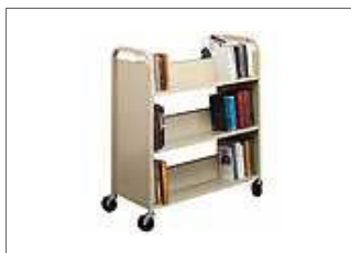
Number of empty book trucks growing in Technical Services

Our current total of 73 cataloged already exceeds totals for the entire year from three of the last four years.